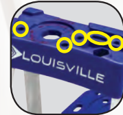
Screwdriver & pliers slots