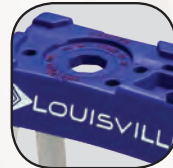
Paint bucket holder