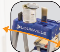
Curved ergonomic front