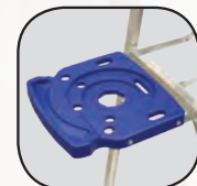
Pail shelf with many of the same features as the top!

AS2100 ELYER 2013 v1 © 2013 Louisville Ladder, Inc. All rights reserved.