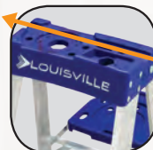
Pipe & 2x4 holder